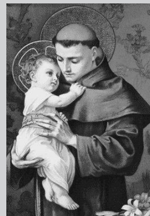
St. Anthony of Padua

Masses: Saturday 5:00 p.m. Sunday 8:30 a.m.